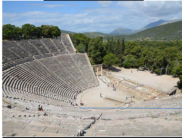
Theatre in Epidaurus

https://images.search.yahoo.com/search/images;_ylt=Awrilte1hg1